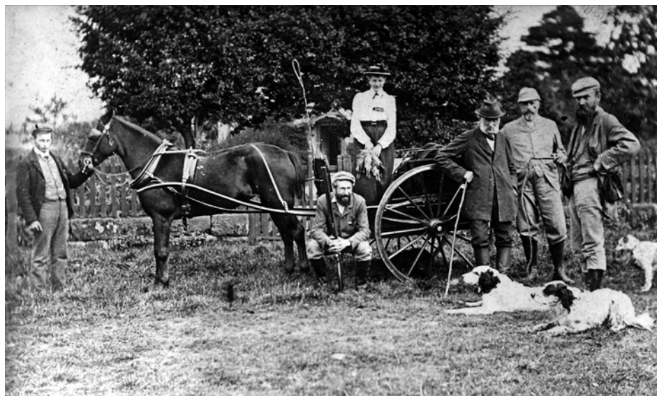
At Ranton Abbey. 1898.