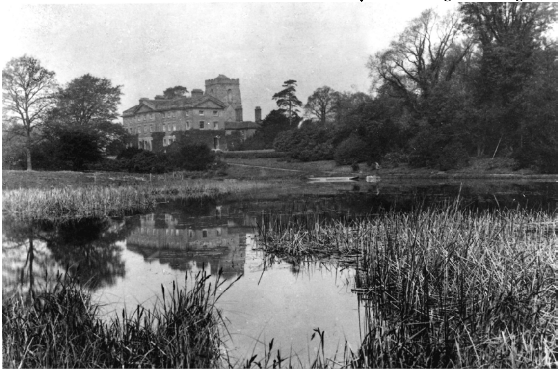
Ranton Abbey, Staffordshire.

From 1889 to 1900 he rented Ranton Abbey and its large shooting in